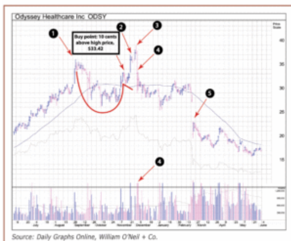
Figure 1. Selling on the 7% Rule

Odyssey Healthcare illustrates how sell signals are often present before bad news becomes public. The big gap-down in February 2004 was caused by the company saying its first-quarter profits would come in below analysts' estimates. Published reports also began to raise questions about the company's standards of service for Medicare patients.