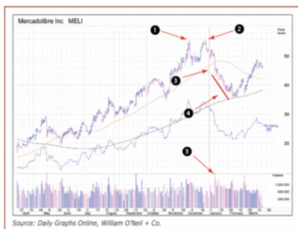
Figure 3. Identifying Weakness in a Stock as a Sell Signal

MercadoLibre (MELI) is a Latin American online marketplace that sells a range of consumer goods, including electronics, clothing, collectibles and even real estate. The stock went public in August 2007, and has a three-to-five-year earnings growth rate of 168%. Sales have grown in every single quarter since March 2006, and Wall Street expects profits to increase at a double-digit rate in the next two years.