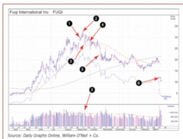
Figure 6. Sell Signals Preceding Bad News

The stock, which became public in October 2007, was among those beginning a strong run-up just as the general market turned higher in March 2009. Around that time, it cleared a steep cup-shaped pattern that began in 2008. (The cup pattern has been a precursor to many big winners of the past, so it is not a bad idea to pay attention when a stock with great fundamentals is forming a cup base.) In the summer of 2009, Fuqi offered alternate buy points as it found support above its 10-week moving average.